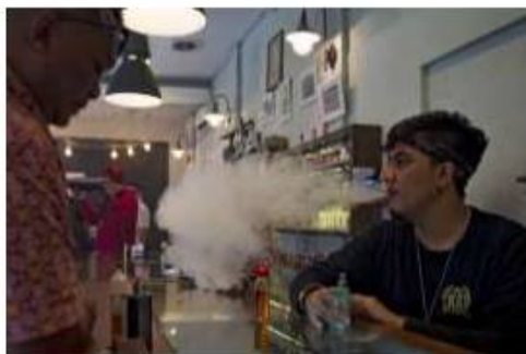
This photograph taken on January 9, 2018 shows an e-cigarette cafe employee (R) vaping beside a customer in Jakarta.

NEW DELHI: Fearing a blanket ban on e-cigarettes by the government in view of the limited awareness about the relative benefits of vaping over smoking, the Association of Vapers India (AVI) on Saturday stressed that nicotine should not be blamed for smoking-related deaths.